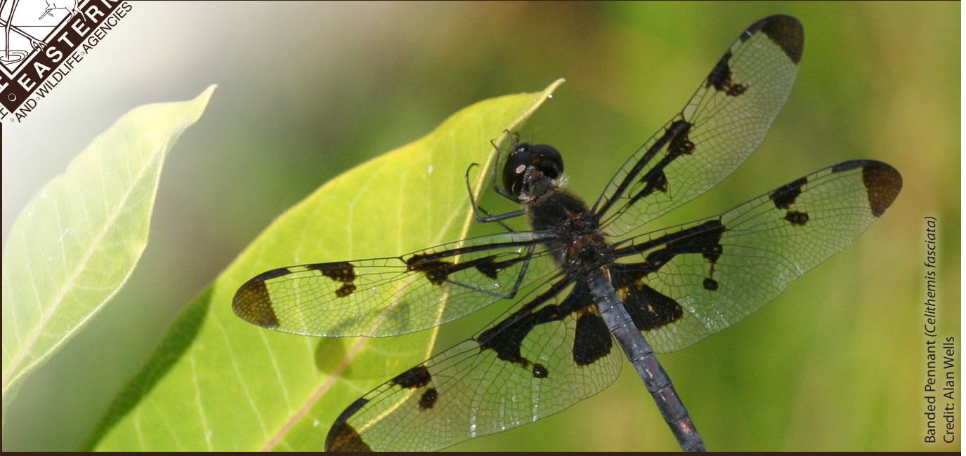
Banded Pennant ( Celithemis fasciata)

REGIONAL CONSERVATION NEEDS www.rcngrants.org